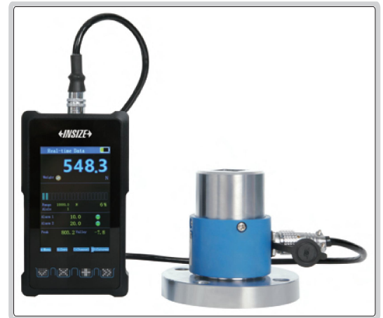
Example of torque sensor connection