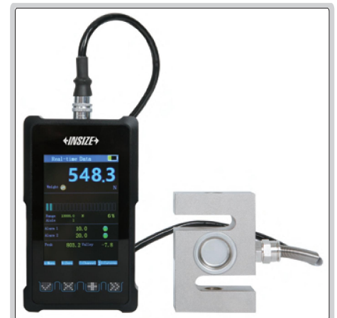
Example of force sensor connection